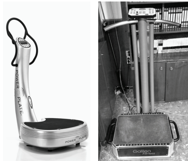
FIGURE 2: Power Plate and Galileo vibration platforms.

Level 2: one trial of level A2 or at least two independent trials of level B (see the Appendix); 3: one trial of level B or C (see the Appendix).